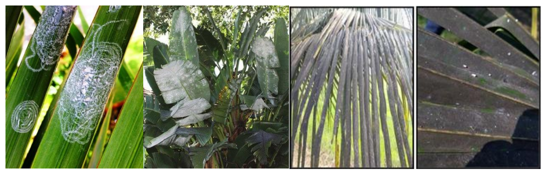
Infestation of RSW and development of black sooty mould on Coconut leaves